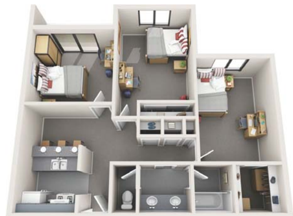
FSA FOUNDERS APARTMENTS TYPICAL 3 BEDROOM APT PLAN

More information, including links to all the services offered by USC Auxiliary Services can be found on our website at housing.usc.edu