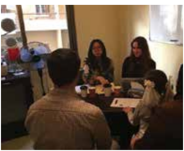
IHRC students work late hours meeting with clients, transcribing interviews, preparing intake reports and drafting declarations.

IRAP resubmitted the case to Humanitarian Corridors, an Italian humanitarian visa program. That second submission was approved in late 2019.