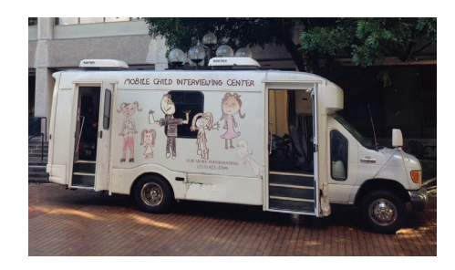
Child Interviewing lab at USC Gould