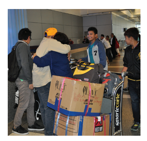
IHRC students have spent the past five years working with judges, testifying in Washington, D.C. on international human rights matters and representing clients in the United States and around the world.

with all of the current international tribunals that prosecute mass atrocities: the International Criminal Court, as well as the Extraordinary Chambers in the Courts of Cambodia, International Criminal Tribunal for Rwanda, Special Tribunal for Lebanon and the Yugoslav Tribunal.