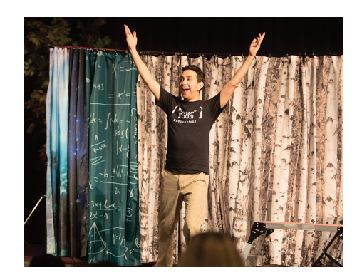
Writer's Room Productions: One of the SBC's clients was a nonprofit that brings to life short stories written by K-8 students.

Setting up the 501(c)(3) with the Internal Revenue Service to secure Al Otro Lado tax-exempt status proved particularly challenging because the