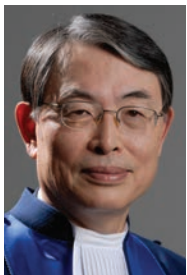
ICC President Judge Sang-Hyun Song

(International Court, continued from page 1)