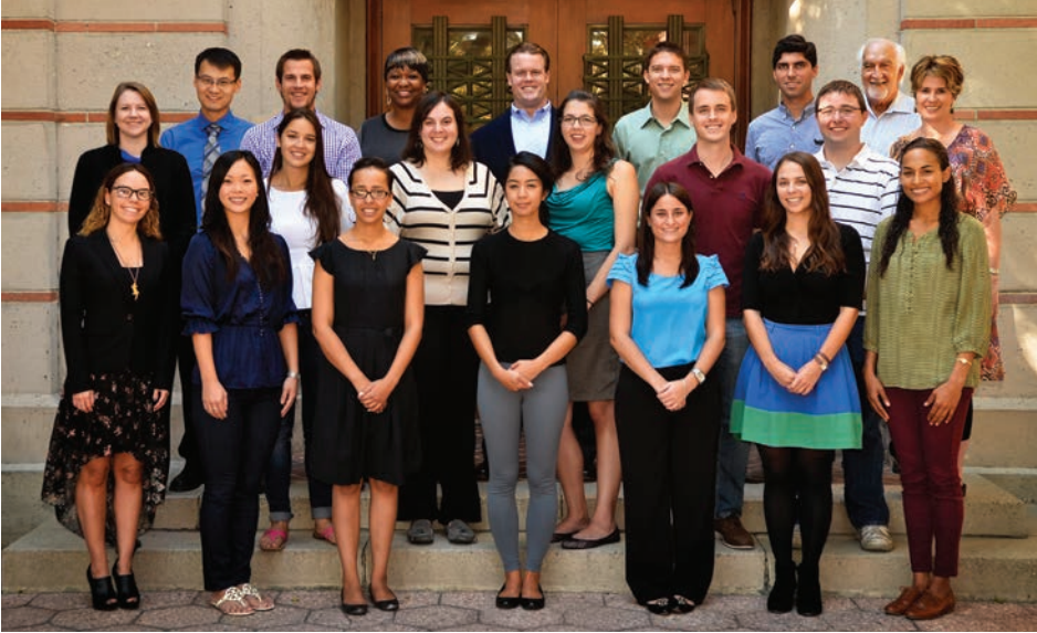
Post-Conviction Justice Project students, faculty and staff work on behalf of clients serving life terms.