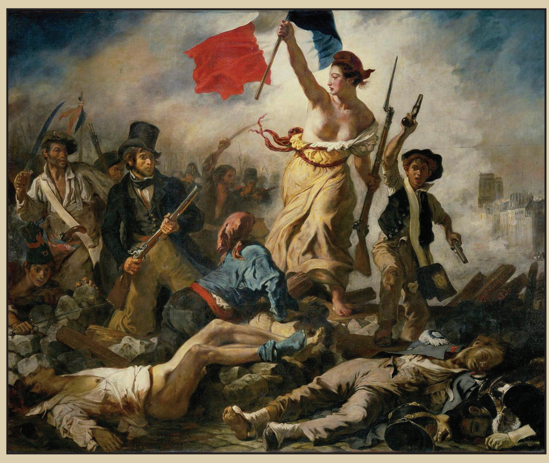
Eugène Delacroix, Liberty Leading the People, 1830

Thursday, February 15<sup>th</sup>, 2018 4:00 - 5:30 p.m. Doheny Library, Room 240 Reception to follow