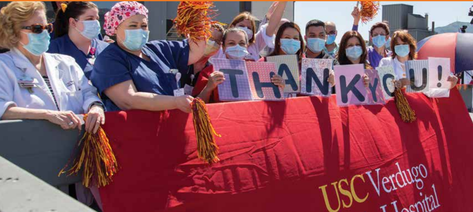
Frontline workers at USC Verdugo Hills Hospital at an event to thank firefighters and law enforcement for their work during the pandemic.