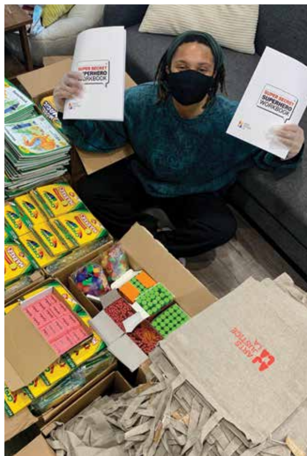
figure. Kids are encouraged to create a superhero version of themselves. The workbook guide features Sylla's example: Lady Liberty, attorney by day, freedom fighter at night.

The art kits, inspired by the movie Black Panther , include a movie poster, a comic strip and an action